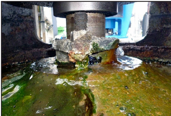
Leakage from previously installed compression packing.

After the good results with the first pumps, the remaining cooling tower pumps are now being upgraded to Chesterton Split Mechanical Seals .